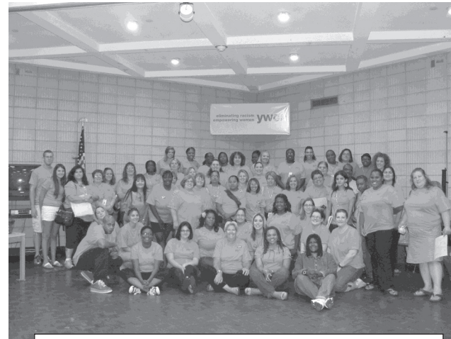
YWCA Hartford Region child care staff completed their August training. This training exemplifies YWCA's commitment to quality child care.

Thank you to our child care staff for their hard work and dedication to assure children are ready to learn and grow.