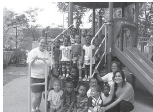
Employees from Bank of America volunteered at YWCA's Early Learning Center in East Hartford. The volunteers assisted YWCA staff with activities for children.

In addition, a group of volunteers from Northeast Utilities came to Camp Aya Po armed with bucket trucks, chain saws and other equipment to trim trees, clear brush and pull in the docks from the very chilly pond. YWCA thanks all of the volunteers and their employers for this donation of time and talent. Thank you for caring!