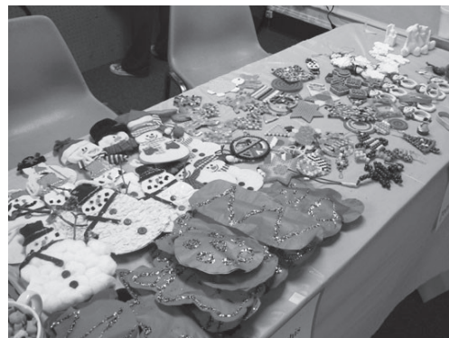
Many of the hand made holiday crafts that were sold at the YWCA Craft Fair.

Thank you to all the volunteers, donors and guests for making this event a huge success and for supporting our mission to provide quality and affordable child care.