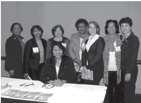
YWCA Hartford Region Board Members with Michelle Singletary (seated) at the 9 th annual Money Conference for Women

Over 300 women attended the award-winning YWCA Hartford Region's 9 th annual Money Conference for Women on October 23 to hear Michelle Singletary and attend financial focus workshops. They learned that whether it is $500 or $5, any amount of money can make a difference, and every penny ought to have a purpose.