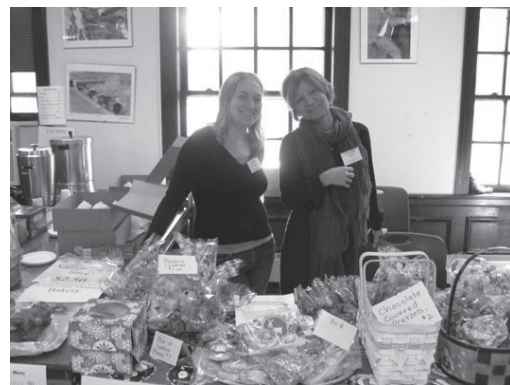
Volunteers selling donated baked goods at the YWCA Craft Fair.