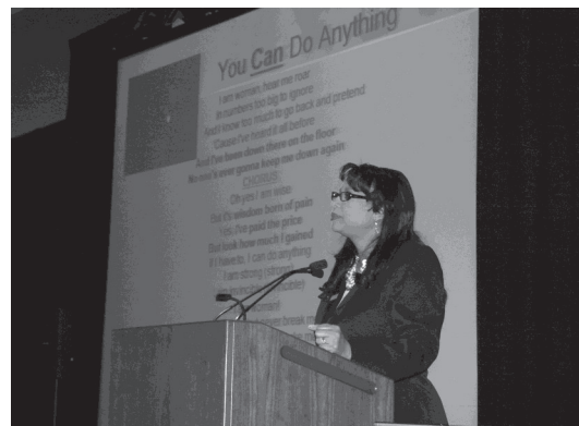
Photo top: Conference participants at the Retirement Planning workshop sponsored by Prudential.